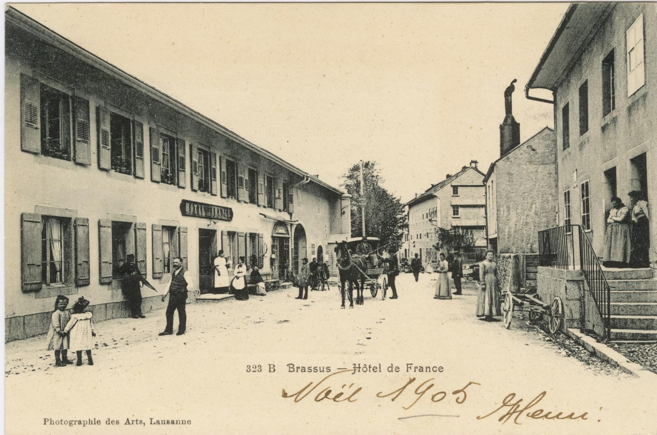
323 B Brassus — Hôtel de France

Hôtel des Horlogers remains the meeting point where local and international nature and watchmaking enthusiasts come together.