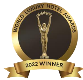
Luxury Design Hotel - Continent - Europe