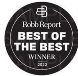
Best in Travel Award