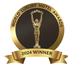
Best Architectural Design – Western Europe Luxury Boutique Hotel – Switzerland Luxury Sustainable Hotel – Switzerland