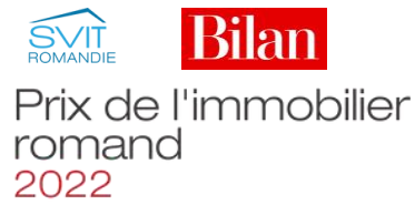
Coup de Cœur du Jury