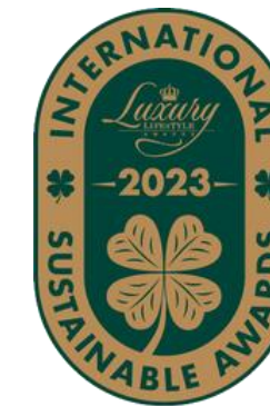
International Sustainable Award