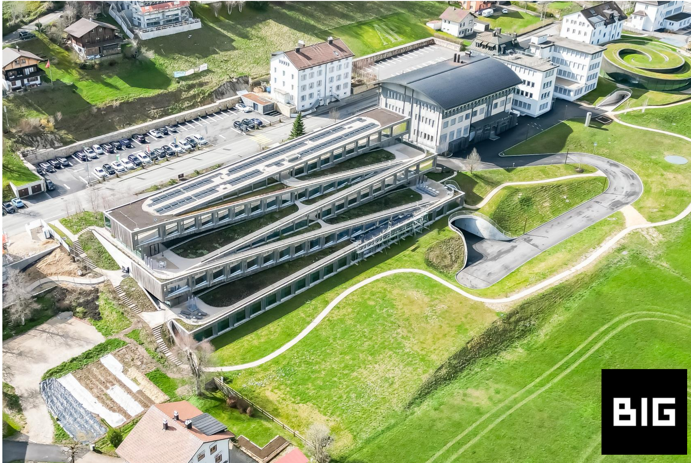
A design based on the harmony between Nature and Architecture.

Currently involved in a large number of projects across Europe, North America, Asia and the Middle East, BIG has won international acclaim for its work at the Hôtel des Horlogers.