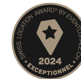
Quality label "Exceptional" Swiss Location Awards