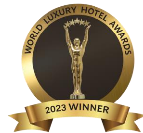
Luxury Eco Hotel – Continent – Europe Luxury Design Hotel – Country – Switzerland Luxury Lifestyle Hotel – Country – Switzerland